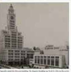
The Provencence building

Reimagining the historic Philadelphia City Hall building as a modern, multi-use development is a challenge. The building's iconic clock tower and ornate facade are central to its identity. The new development, The Provence, will preserve these historic elements while adding modern amenities and green spaces. The project is a key part of the Center Square program, which aims to revitalize the area around City Hall.