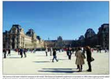
The Provencence building

The architecture of The Provence is designed to create a social community. The building's glass facade and open spaces encourage interaction and collaboration. The building is a key part of the Center Square program, which aims to revitalize the area around City Hall.