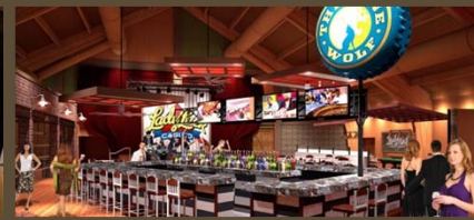
Table Games Offered